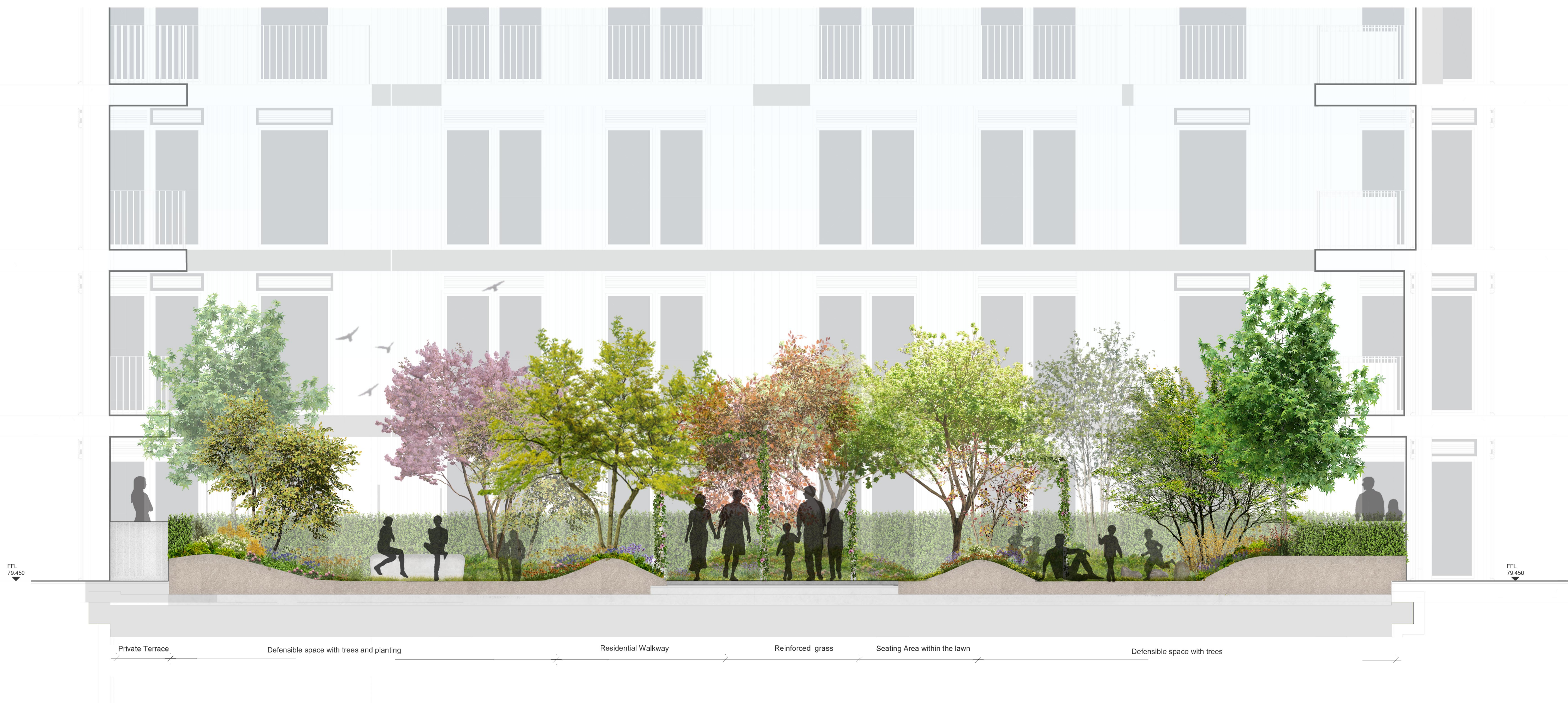
1 Residential Courtyard Section - Block A1 and Block A2 scale 1:50 @A0