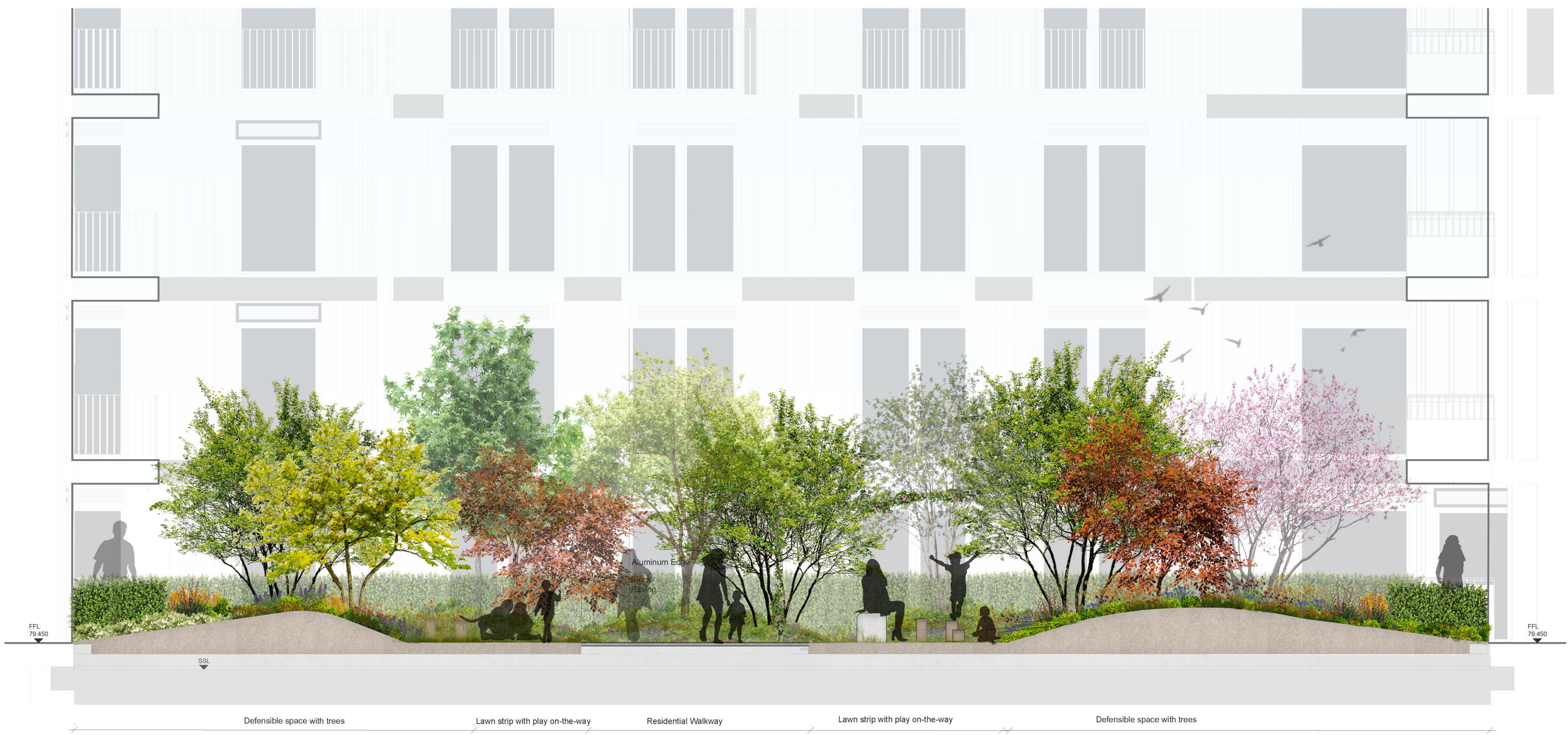
2 Residential Courtyard Section- Block A2 and Block A3 scale 1:50 @A0